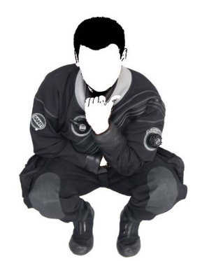
Pic. M. Position to release air from the suit.

In order to keep the drysuit clean, prior to each dive wash your body and wear clean underwear. Checking of the drysuit should be done in accordance to the point about periodic inspection of this manual.